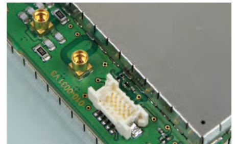
Zero loss - no degradation of radio performance