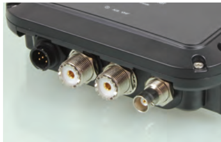
Share a single antenna for VHF radio, AIS and FM/DAB radio