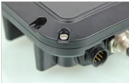
Small integrated product, easy to install